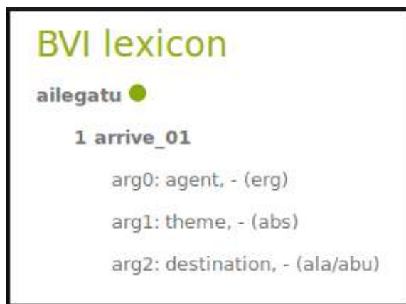
Figure 2. The entry of the verb ailegatu ('to arrive') marked with a green bullet to warn the user that it is an automatically analysed verb.

All these entries that are obtained automatically will be marked with a green bullet in the lexicon (Figure 2) 19 to tell the user that the verb entry has been created automatically through automatic tagging of the corpus.